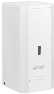
DJ0037A White epoxy finish