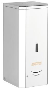
DJ0037AC Bright finish