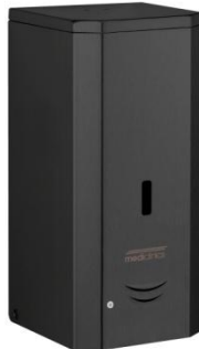
DJ0037AB Black epoxy finish