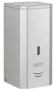
DJ0037ACS Satin finish